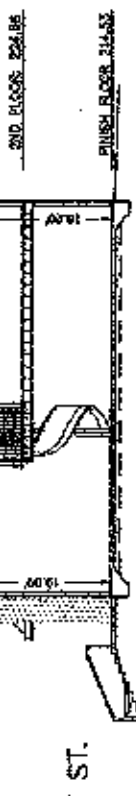
CROSS SECTION "A" (TYPICAL) SCALE: 1" = 10'

BY: [Signature] DEPUTY DOCUMENT NO. 2006-1912738